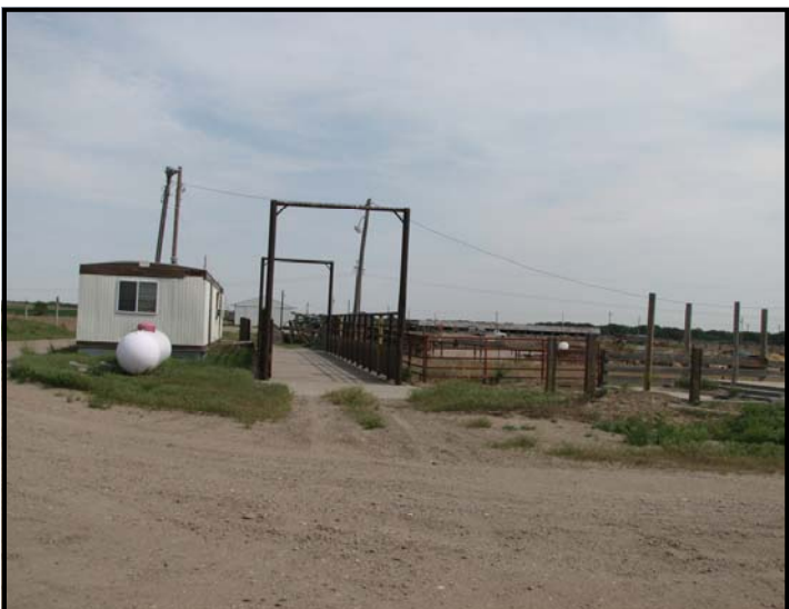
Scales & Scale House