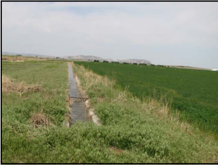
Typical Concrete Ditch

There are two irrigation wells - NE Reg #'s G-08055 (750 GPM) and G-072134 (600 GPM) along with 428 acres surface water rights under Central Irrigation District. The 2012 O&M charge for surface water is $7,072 or $16.50/acre. Surface water is available May through September. 14 tower 1981 Lo-Pressure Lockwood Pivot, 40 HP US Electric Motor, Western Land Roller Pump, full line of gated pipe for one time lay down. 15 HP Electric Motor & 8' irrigation pump at re-use pit.