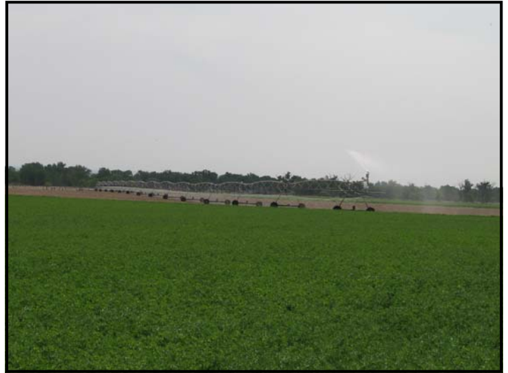
Lockwood Pivot in Alfalfa and Corn