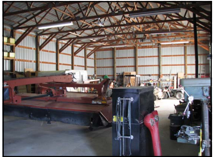
Interior of shop with full concrete floor