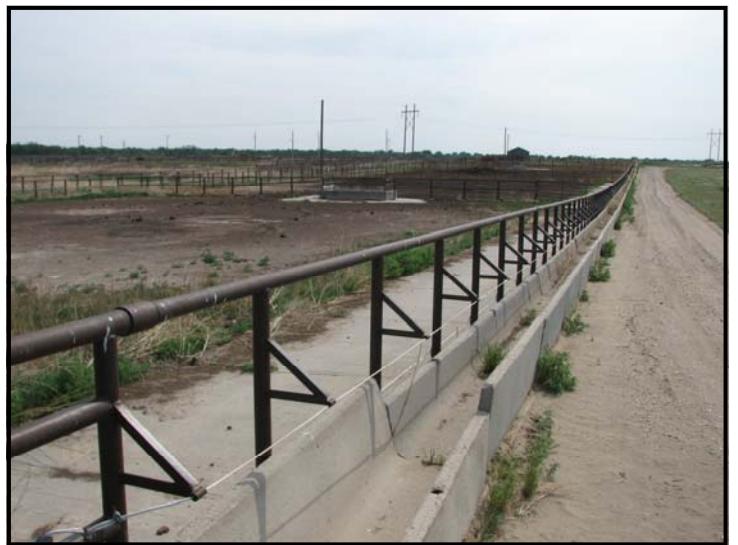
Feed bunks with apron