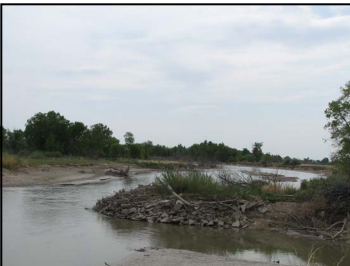
North Platte River

Excellent waterfowl, deer and turkey hunting along the North Platte River, as well as fishing in the two large ponds and live winter stream. Just southeast of Scottsbluff Treatment Ponds that provide open water winter refuge for ducks and geese. Meadow goose pits have been utilized for excellent goose hunting.